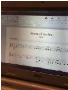
Students using the computer to analyze and create their own music compositions.

Here are few examples of how we use technology in the classroom: