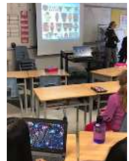
Grade 4 class using the LCD Projector to display Greek art to support them to recreate an art piece using this style.