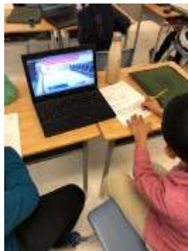
Grade 2 students doing research on a Winter Olympic Event using a graphic organizer. The end Goal of this work is for The students to create their Own poster to advertise the Event.